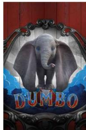
DUMBO | G | 28 JULY 1PM