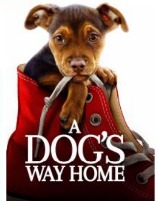
A DOG'S WAY HOME | PG | 21 JULY 1PM