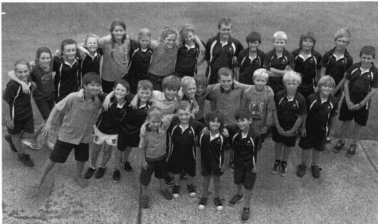
OUR JUNIOR GOLFERS AT THEIR PRIZE GIVING LAST TERM