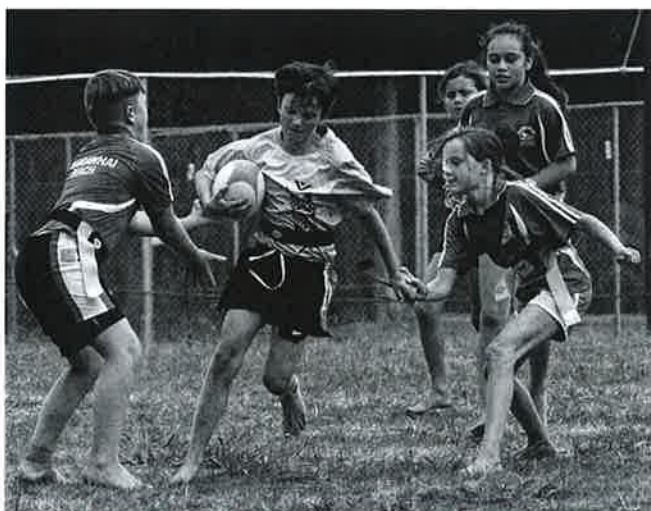
Well done to our Year 5/6 Rippa team who made it into the final in Whangarei.