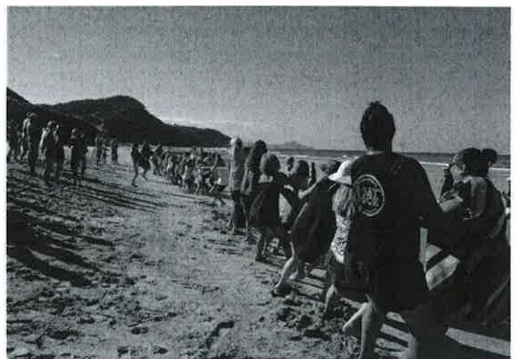
Tug O War at Friday's beach day.