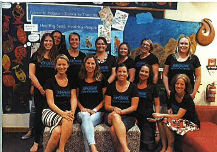
Just some of our lovely parents on our Fombs team