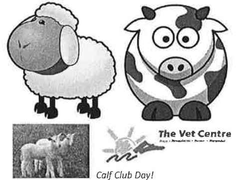
Calf Club Day!

Visit any one of our four clinics with your pet lamb and we will vaccinate and dock your lamb for free!